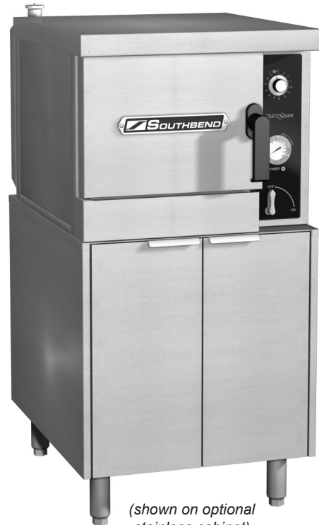
(shown on optional stainless cabinet)